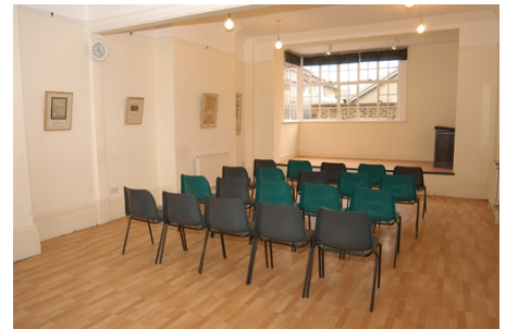
From left to right, Templeton House, Haverstock School, William Morris Meeting Rooms