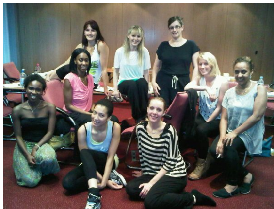
Previous delegates benefiting from our small group training approach.

With an IDTA Associate you can also apply to take the Foundation Degree in Dance Teaching at Bucks New University. This is a route that I took myself and from there took the top-year to obtain a BA (Hons) in Professional Dance Development. This qualification enabled me to go on to study for a PGCE and gain professional teacher status, allowing me to teach dance in adult education institutes and colleges. The IDTA Freestyle Associate was my first step towards a dance teaching career – and I haven't looked back!